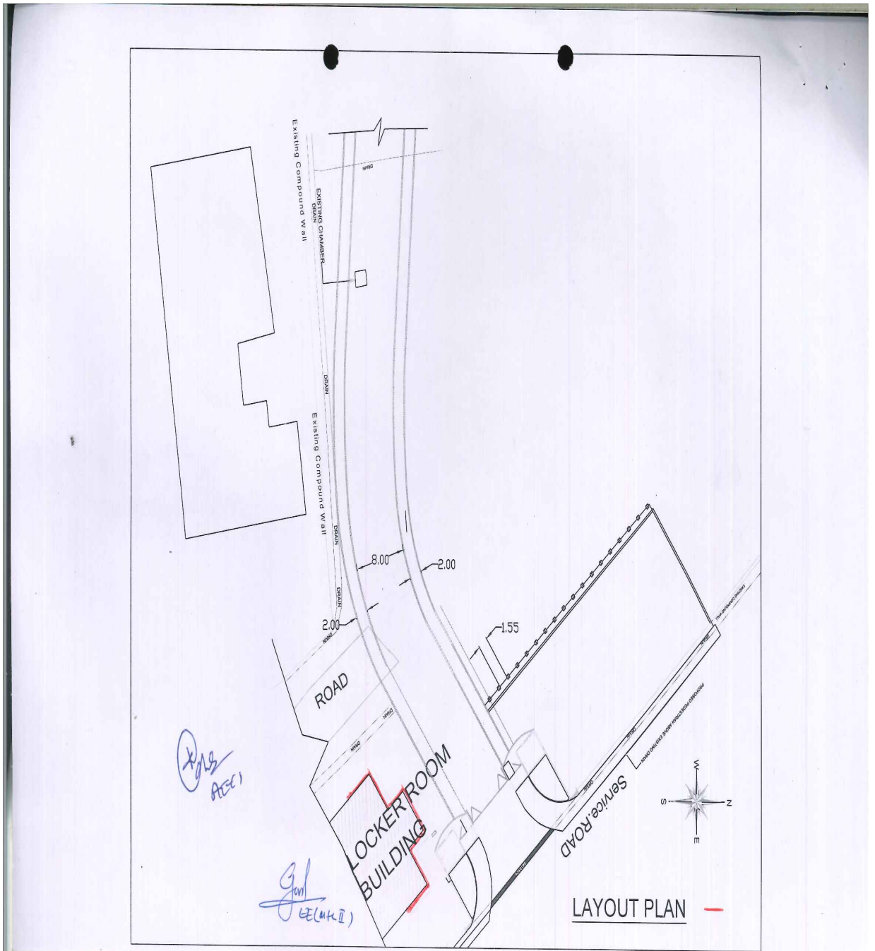
20/87-01 Location Plan