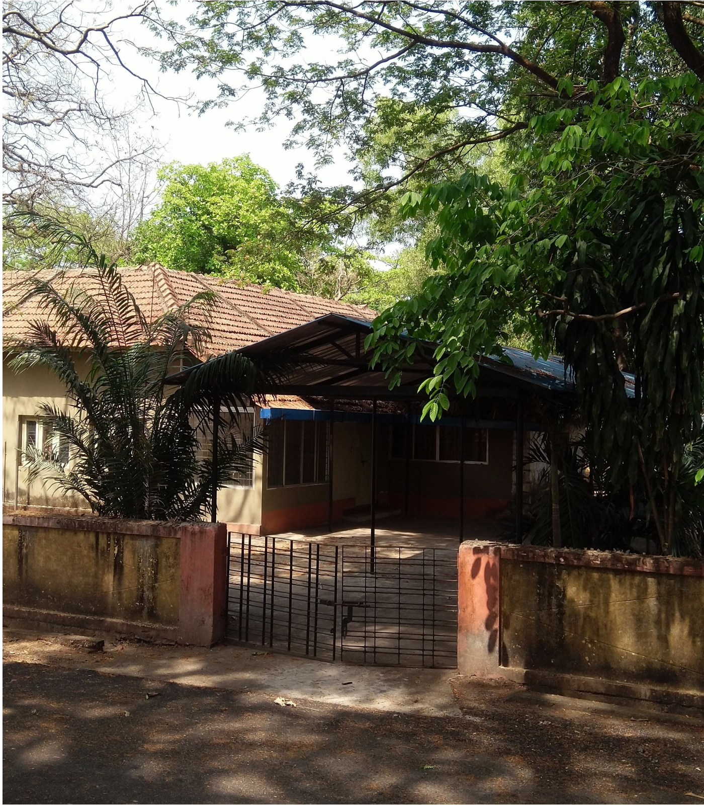
Photograph of proposed Multi-skill Training Centre Building