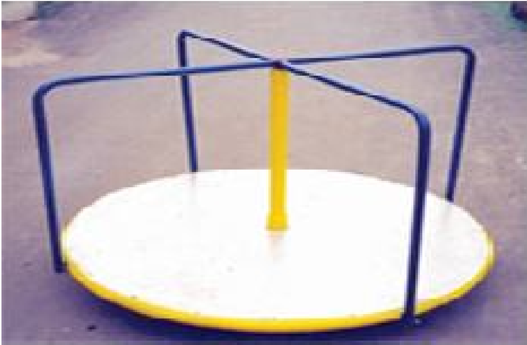
Kids Platform merry go round of 1.20m dia