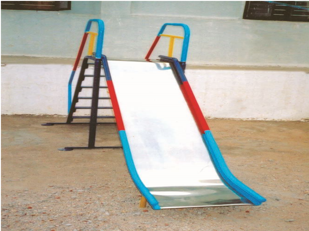
Stainless steel slide