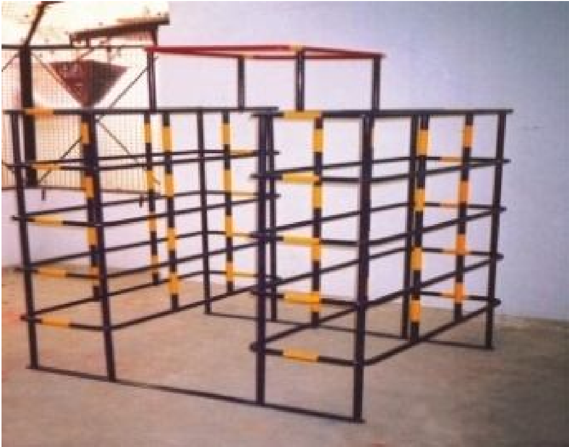
Junior jungle Gym