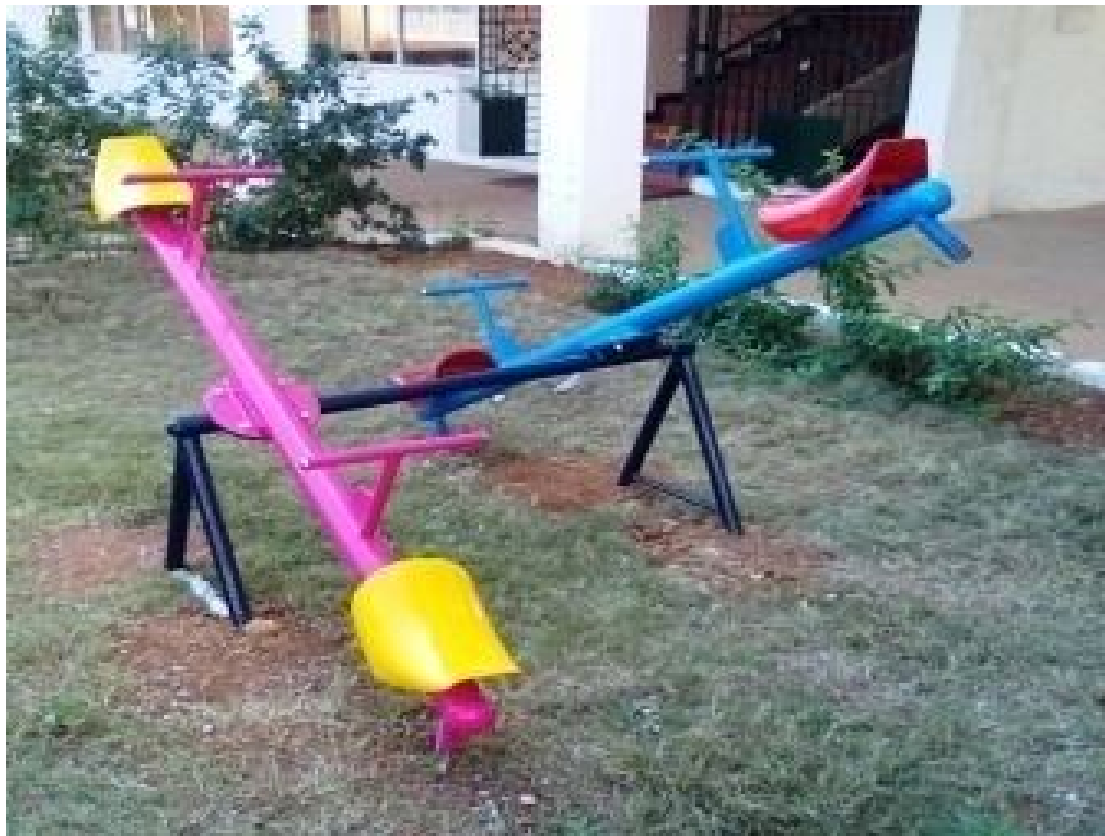
Dual pipe side by side see saw 4 seater