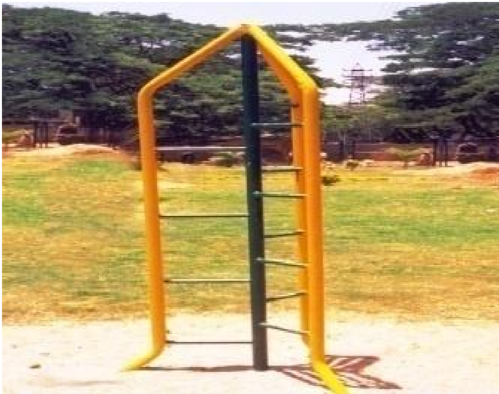
Missile mast climber