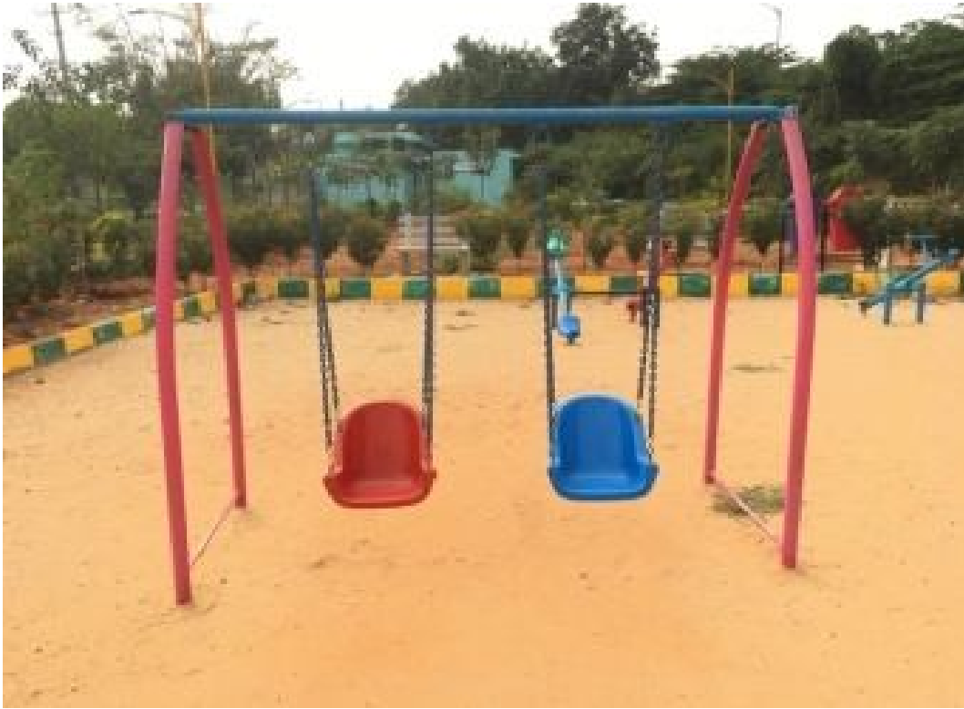
Kids double swing 5ft ht with FRP bucket seat